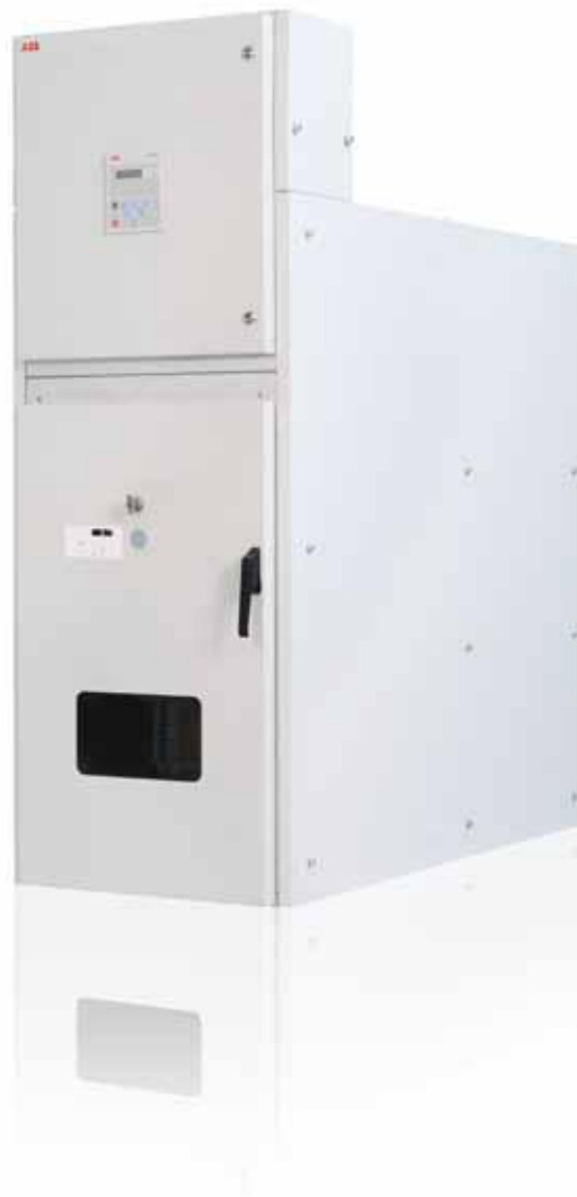
ABB ZN1 primary distribution switchgear is designed to meet the specific needs of the Indian market, with key features such as a compact construction, low maintenance design and an internal arc withstand current rating of 26.3 kA for 1 second that is unique in this sector. The ZN1 range provides an access to the quality, reliability, safety, performance and high level of technical support associated with ABB's global brand.