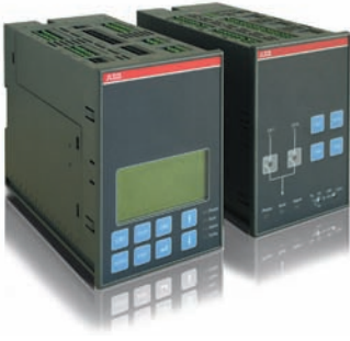
ABB presents the new generation of Automatic Transfer Switch, the result of a worldwide experience on low voltage applications.

The new generation of ATS family – ATS021 and ATS022 offers the most advanced and comprehensive solution in power continuity.